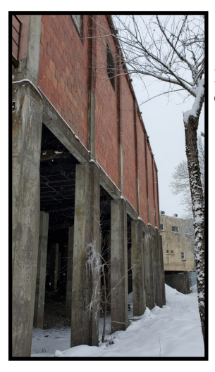
Looking from the NE corner of the building

roof drainage. The project will rehabilitate the columns and footings where needed, correct the roof drainage, and repair the structural and cosmetic damage it has caused to the exterior of the building that faces the river.