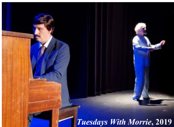
Tuesdays With Morrie, 2019